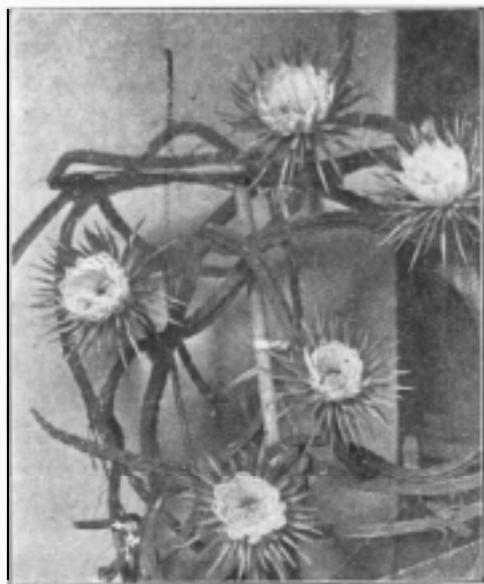
No. 1—Cactus Grandiflorus.

the name Night-Blooming Cereus. It is a green stemmed climber, indigenous to Jamaica and possibly elsewhere in the West Indies. It is abundant in some parts of Mexico*, and when protected from frost, to which it is very sensitive, is cultivated in temperate regions, where its magnificent flower, from 8 to 10 inches in diameter (Fig. I), opening after sundown and decaying next morning, is an object of interest and delight. It has long been known to botanists, but the first general introduction of the name to the public, about the middle of the last century