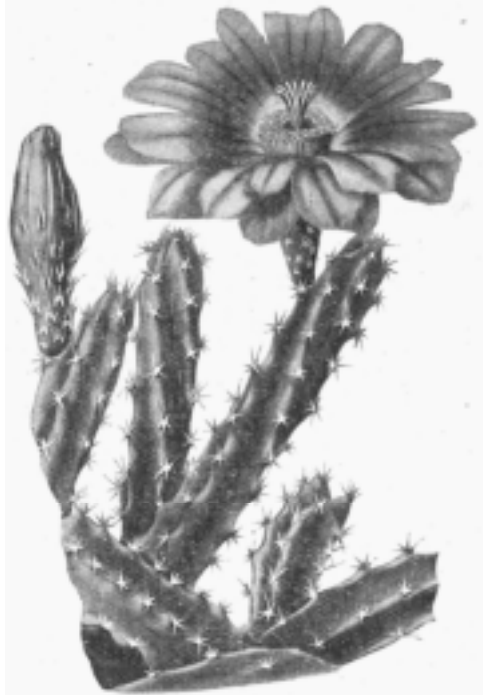
No. 3— CEREUS PROCUMBENS .

In this connection, we will state that because differentiating chemical tests are altogether wanting, at present no possible method of chemical or physical test can determine the authenticity of a preparation of true Cactus Grandiflorus or distinguish it from that of an imitation made of any of the hundreds of other common and usually cheaper species and varieties of cactus. For this reason physicians must rely altogether on the intelligence, care and integrity of the manufacturer whose preparations they use and whose record is established in medicine. Our experience has been that for months together we could supply no Cactus Grandiflorus under our label owing to difficulty in obtaining the genuine crude drug in prime condition, although substitute species were available by the ton at comparatively little cost.