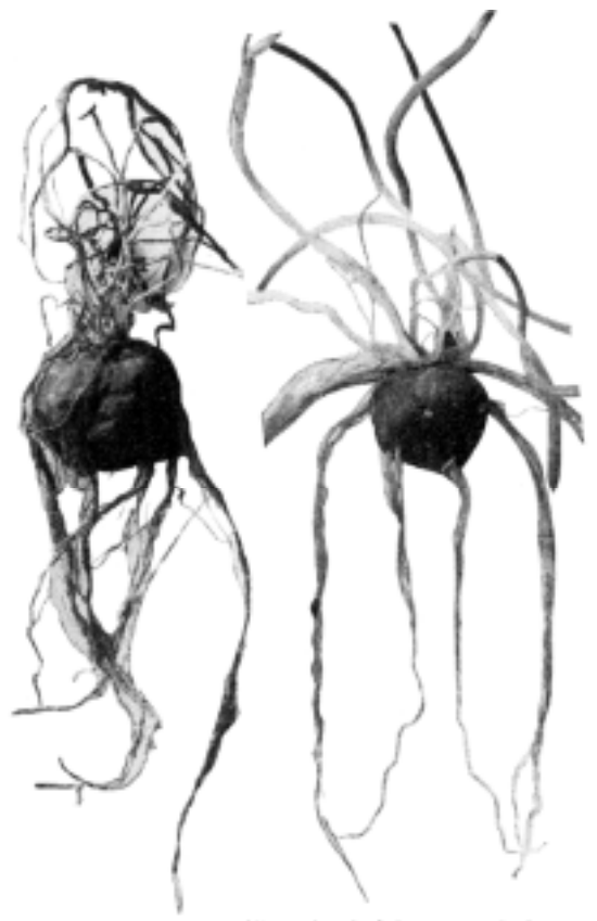
F10. 5 .--- Corms of Claytonia virginica, natural size.

Second-Dicentra cucullaria, called Dutchman's Breeches, a form with more acute spurs, which has more