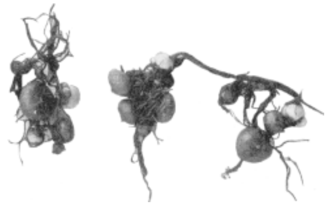
FIG. 4 -Corms of Dicentra canadensis, natural size. 6

sis, called Turkey Corn, with round flower spurs and globose corms.