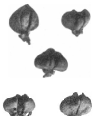
FIG. 1.-Young corm of Dicentra cucullaria, natural size.

Dicentra canadensis produces globose, flattened corms, of a yellowish or brownishyellow color when fresh, slicing turniplike and semitransparent throughout (Fig. 4). The new corms dry yellowish and translucent, and then become very hard and horny. They are so different in appearance from the corms of Dicentra cucullaria, that is botanically so nearly like it, as to render the replacement of the one by the other impossi-